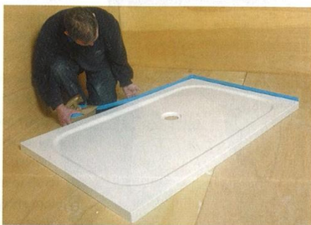
Black bonding agent is lined up on the outside edge

Classic Marble says that Classi-Seal contains patented