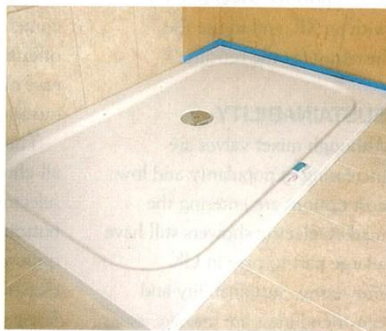
Tiling can begin immediately

The Classi-Seal provides immediate waterproofing and is specifically designed to accommodate vertical